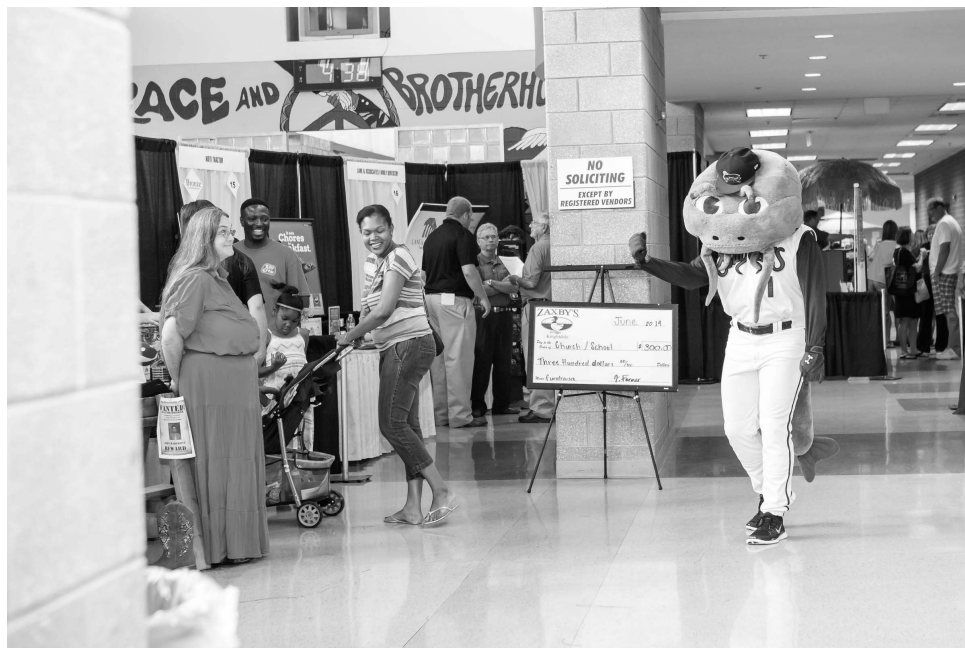
Knightdale Business Expo 2014.

A variety of games — board, card, computer, etc. — are available for play with friends or family. Teens can also sign up for Minecraft in the Computer Lab! Refreshments will be provided. GAME ON!