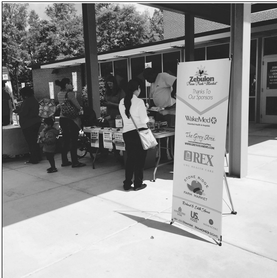
Zebulon Farm Fresh Market Drew a Big Crowd for Its May 2, 2015 Opening.

Most events are free, although occasionally classes — such as the Painting Class above — cost a small fee. If you're 60 or older and looking for activities that are enjoyable, informational, and well attended, stop by the Mount Pleasant Community Building, located at 7637 Harris Road in Bailey. For more details, contact Holly Edwards at 252.459.7681.