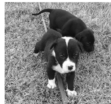
(Photo: Pups rescued by Maggie Society after they were found with their stray mother, under a Nash County farm building.)

Either way, get to know Maggie. Help, donate, or call when you need them. As long as they have a pair of hands available, they will come to the rescue.