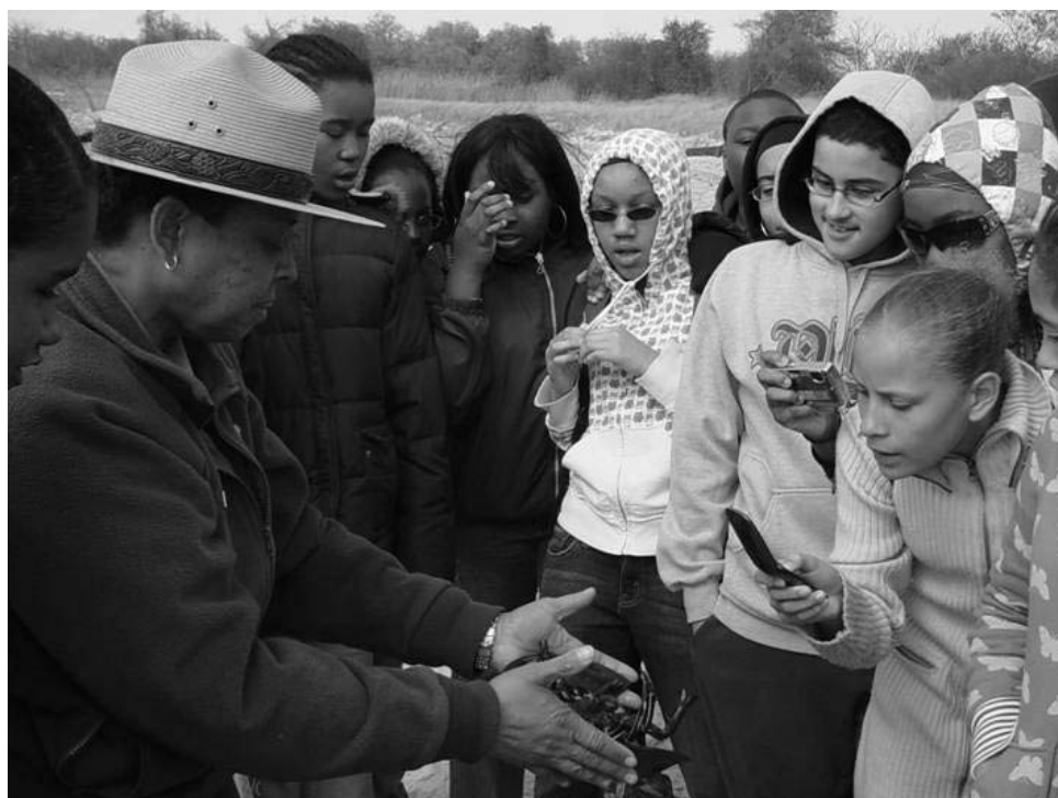
Horseshoe Crab Discovery at Gateway NRA.

Dining | Special events and planning 3033 Hwy 301 S, Wilson, NC 252-291-5171