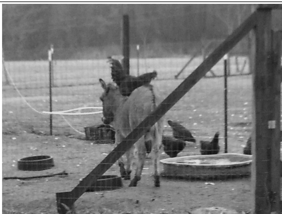
As the snow melted away, one of their roosters hitched a ride on their donkey... either for the fun of it or to keep his feet dry!

Winners will be contacted in late April and announced in early May.