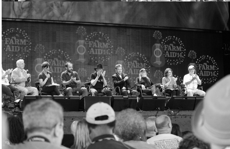
Pre-concert Press Conference included Farm Aid founders and local farmers.

Fifteen years ago, had tickets for a Farm Aid concert in Virginia, but did not get to go. On September 13, 2014, Farm Aid 2014 came to Raleigh. Not only did I finally get to attend Farm Aid; I was able to share it with my family.