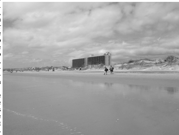
View of Shell Island Resort from their beach

We hope to return during the off-season but before the warm ocean water cools.