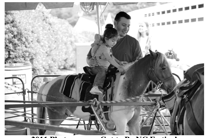
2011