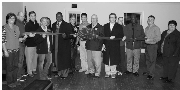
Town Council Members, Parks and Recreation Representatives, and Guests at the ribbon cutting.

The grand opening and ribbon cutting for the K-FIT Center were held the evening of January 23, 2014.