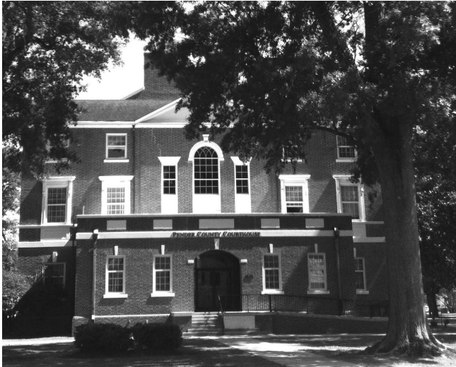
Pender County Courthouse in Burgaw serves as the Chester’s Mill Town Hall for CBS’s Under The Dome TV series

Submit your location! The more locations available in the Eastern NC area, the more opportunity to draw producers. As NC draws productions to the state, these locations will be readily available to fit producers’ needs.