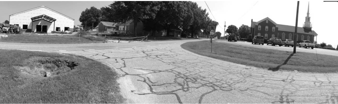
Pilot Baptist Church’s Family Life Center construction progress as of September 10, 2013.

The ground-breaking took place May 5, 2013 in the large field adjacent to Pilot Baptist Church. This grassy space, formerly used as a playing field and event location, will soon host meetings and events indoors with a capacity to hold hundreds of people.