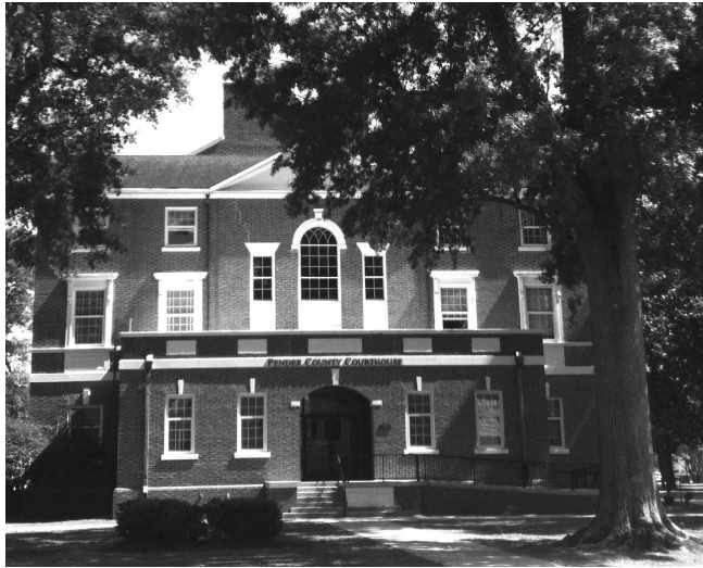
Pender County Courthouse in Burgaw serves as the Chester’s Mill Town Hall for CBS’s Under The Dome TV series