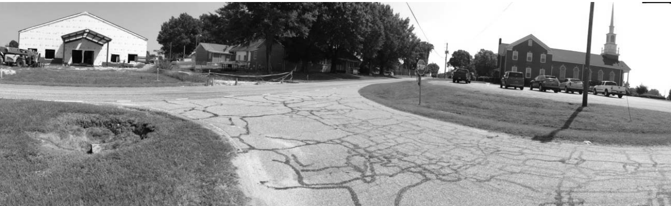
Pilot Baptist Church’s Family Life Center construction progress as of September 10, 2013.

The ground-breaking took place May 5, 2013 in the large field adjacent to Pilot Baptist Church. This grassy space, formerly used as a playing field and event location, will soon host meetings and events indoors with a capacity to hold hundreds of people.