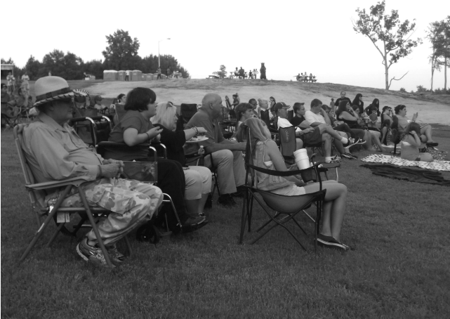
Part of the crowd on the grass enjoying the event

Ed. Note: The Grey Area newspaper is proud to be a sponsor of both The Impact Challenge 2013 & the Bunn Centennial Year.