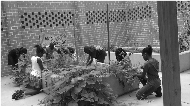
Garden