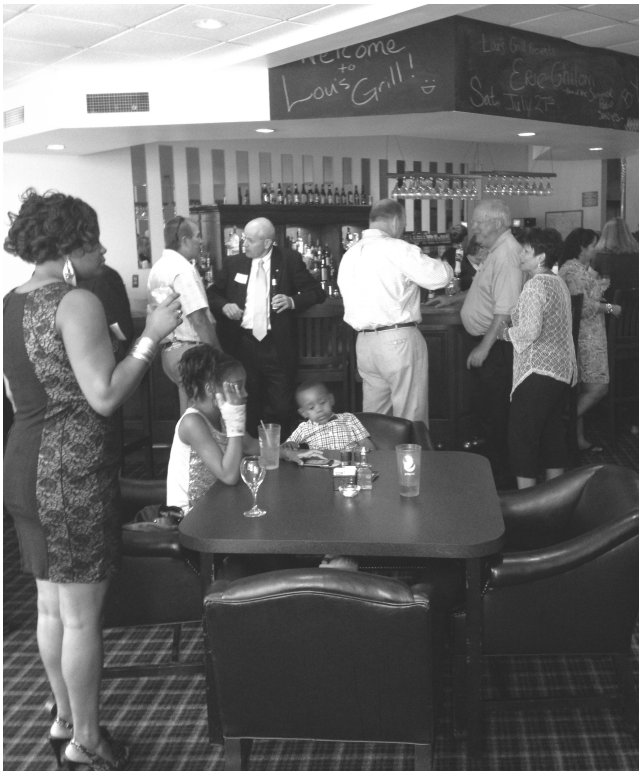
Networking at the Nashville NC Chamber Annual Meeting

July 17th the Nashville Chamber of Commerce held its annual meeting at Lou’s Grill inside Birchwood Country Club. Local businesses were well represented for this social and business meeting, including heavy Hors d’Oeuvres and door prizes.