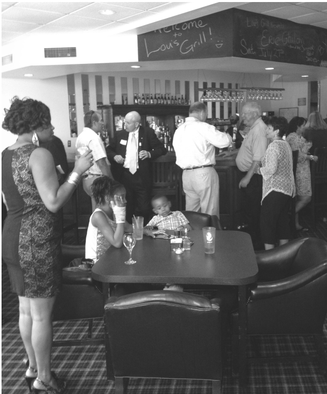
Networking at the Nashville NC Chamber Annual Meeting

July 17th the Nashville Chamber of Commerce held its annual meeting at Lou’s Grill inside Birchwood Country Club. Local businesses were well represented for this social and business meeting, which included heavy hors d’oeuvres and door prizes.