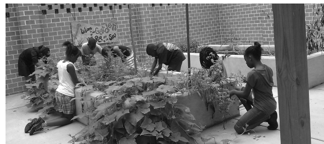
Garden