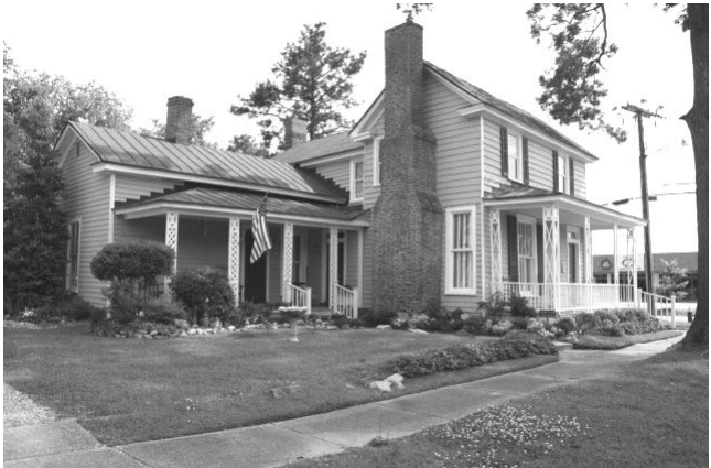
The Archibald White House in 2013 after Renovations

Look up the Tarboro Historic District on Wikipedia.org, and there is mention of The Archibald White House. At 228 years old, this is the oldest house still in its original location. It was built in 1785 when the country was young.