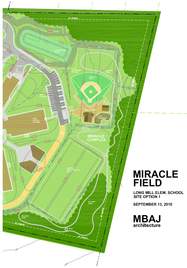
Miracle Field, designed by MBAJ Architecture

The Miracle League of Franklin County is a baseball league for children with physical, cognitive and/or emotional disabilities. Their new field is at Long Mill Elementary School in Youngsville. When completed, it will have a T-ball sized baseball field with a rubberized turf surface to accommodate children with special needs, an all inclusive, wheel chair accessible playground, a 1600 sq. feet field house, and a 0.8 mile walking trail.