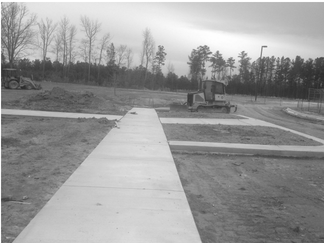
Construction at Long Mill Elementary School for Phase 1 of The Miracle League of Franklin County Complex