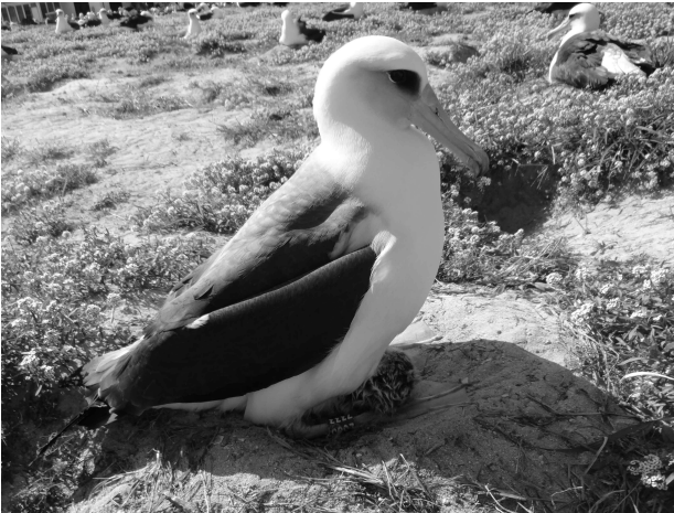
Wisdom & Her Chick

For more information and photo updates, visit www.fws.gov/midway/whatsnew.html