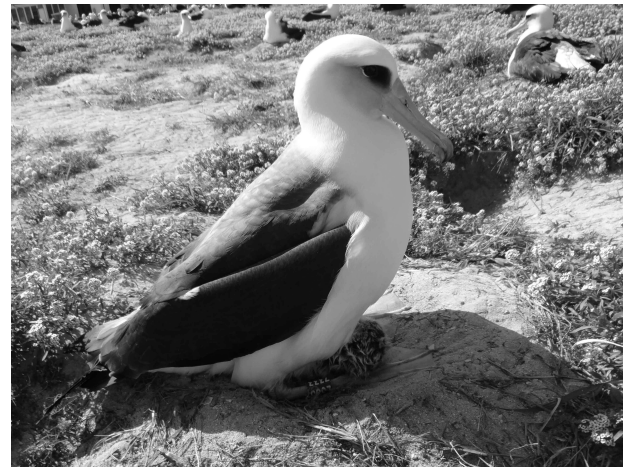
Wisdom & Her Chick

For more information and photo updates, visit www.fws.gov/midway/whatsnew.html