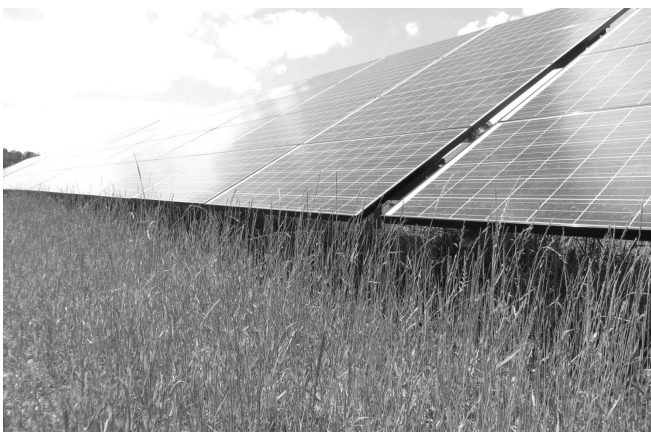
Ground View of Sandy Cross Solar on a Bright Sunny Day.