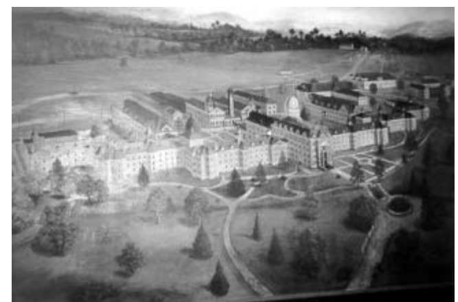
Painting of Broughton Hospital by a patient, early 1900s.

For now, Broughton Hospital is safe from destruction because it is on the national register of historical buildings. But if you are ever in the Morganton NC area, you owe it to yourself to see the hospital that once defined the meaning of “Moral treatment” in the care of NC’s insane population.