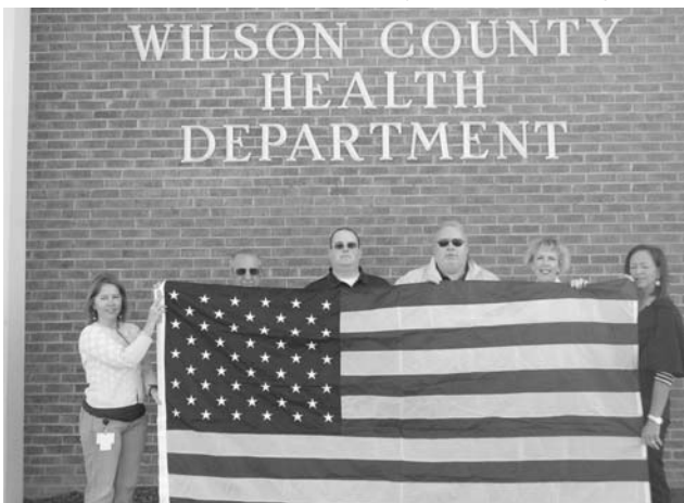
Local Woodmen Of The World representatives present a new US Flag to fly over the Wilson County Health Department

Copyright ©2012 Above And Beyond Learning Corp. The Grey Area™ is a trademark of Above and Beyond Learning Corp.